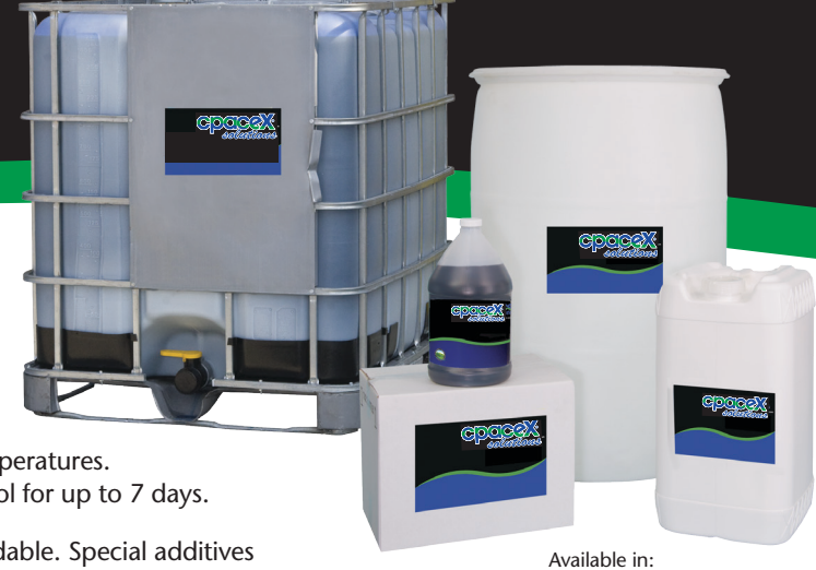
7, 15, 55 and 275

All PowrX formulations contain non-staining rich blue dye and are biodegradable. Special additives in the PowrX blend assist in breaking down waste and scale build-up in the holding tanks. PowrX is available in a wide variety of fragrances and strength levels for your specific need.